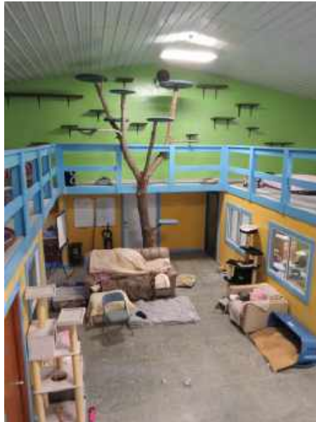
GonaCon study facility (interior)

In both studies, ACC&D encountered ethical quandaries regarding study design, selection of animals, welfare of animals involved, impact of the study on the local