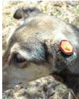
Dog with ear tag

ACC&D has become increasingly active in advancing promising new tools and technologies; in the past 18 months, the organization has managed or sponsored studies of innovations with significant promise. The first study evaluated GonaCon™