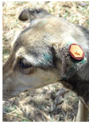
Dog with prototype ear tag (and green antibiotic spray)

The “International” group focused on international animal welfare initiatives, which could range from research for animal welfare (such as ACC&D’s dog ear tagging study) to implementing new projects in a community (e.g., dog population control). The scope was global, with group members particularly sensitive to the unique considerations that emerge with work in developing countries, and with free-roaming animals.