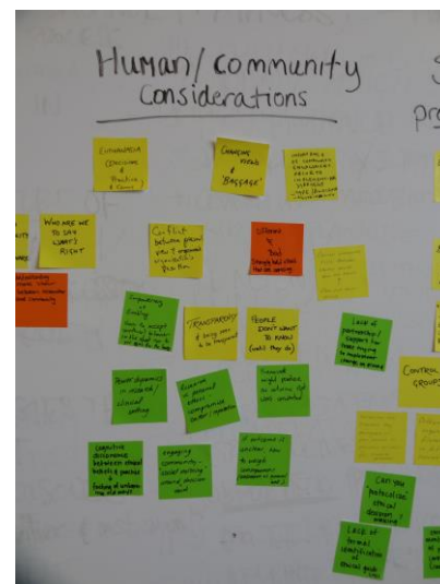
Gathering group input in the “Discovery” phase

of community engagement from the start, since local stakeholders are invaluable in the design of a successful intervention. The group specifically noted the importance of inclusivity in community engagement, including ensuring that the perspectives of less