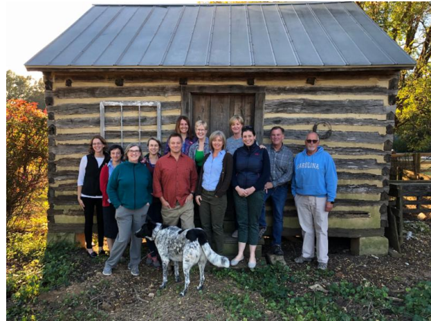
ACC&D Board retreat