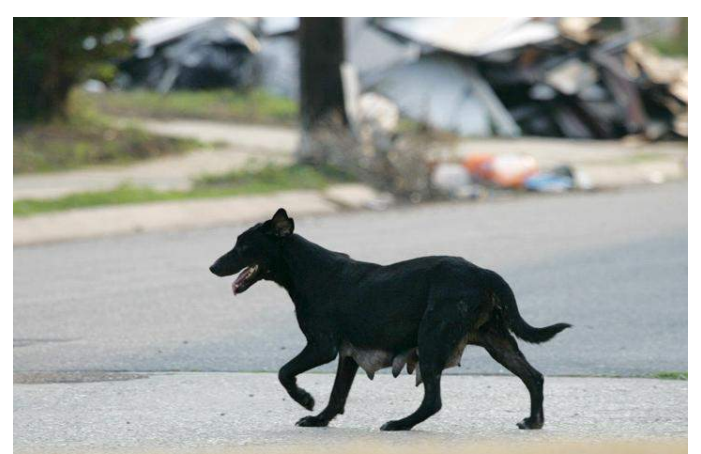
characterize the conservation of TLRs in cats and dogs.