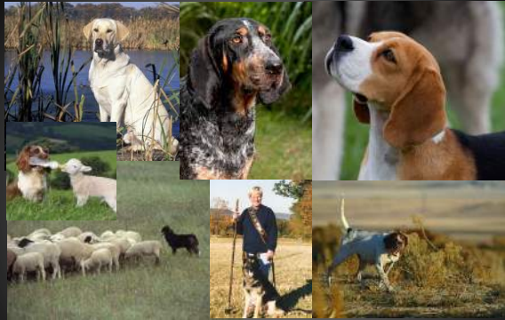
Pointers Herders Retrievers Hounds