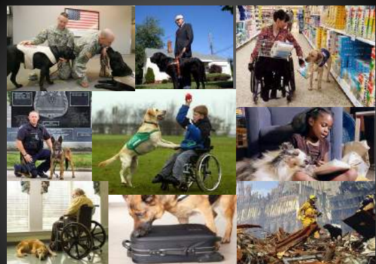
Police and Military - Guiding Eye – Bomb and Drug Detection Reading Assistance – Therapy