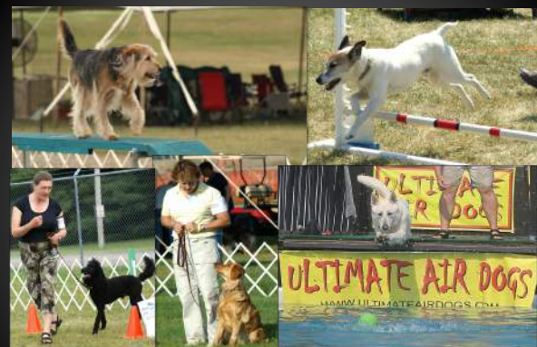
UKC Performance Events