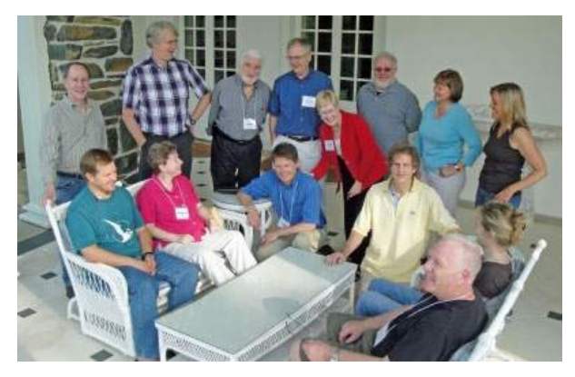
Participants gather after the meeting

Appendix C: Review of recent literature related to population dynamics and population modeling